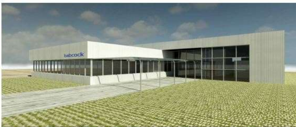
VISTA ACCESO PRINCIPAL

The first two hangars are currently under construction and will be located on the Phase 1 site. These hangars are being built by two multinational companies, INDRA and BABCOCK, which are each carrying out joint R&D programmes with GAIN within the framework of the Civil UAVs Initiative.